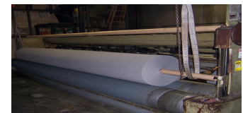
One of Delaware Valley's Automotive Interior Products

This case study is one in a series prepared by the Office of Technical Assistance and Technology (OTA), a branch of the Massachusetts Executive Office of Energy and Environmental Affairs. OTA provides a range of non-regulatory assistance services to help businesses cut costs, improve chemical use and energy efficiency, and reduce environmental impact in Massachusetts. Mention of any particular equipment or proprietary technology does not represent an endorsement of these products by the Commonwealth of Massachusetts. This information is available in alternate formats upon request. OTA's non-regulatory services are available at no charge to Massachusetts businesses and institutions that use toxics. For further information about this or other case studies, or about OTA's technical assistance services, contact: