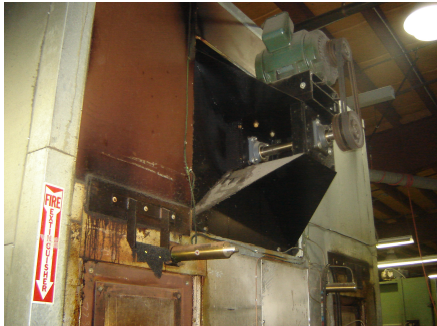
One of Delaware Valley's Textile Heat Setting Ovens

Delaware Valley still needs to use their original space heaters in the winter, but to a lesser extent, and employees report being more comfortable in the factory even during colder temperatures as compared to years prior to installing the heat recovery system. The system will reduce NOx emissions from fuel combustion by about 180 lbs/yr. Savings from the heat recovery system will be reinvested to implement energy efficiency projects, including upgrading lighting and electric drives at both of their facilities, and installing solar photovoltaic panels. Overall, Delaware Valley has had such a positive experience with their air-to-air heat exchanger that they subsequently installed one on a third oven at their Tewksbury location and are investigating one for their facility in Lawrence.