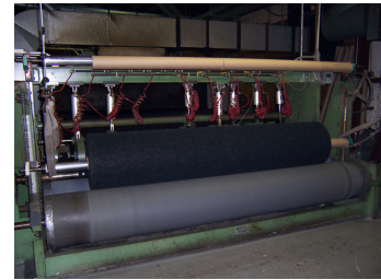
Roll of Black Industrial Mat Coming Out of a Delaware Valley Oven

In 2006, Delaware Valley Corporation installed an air-to-air heat exchanger at their Tewksbury facility to recover heat for both process and space heating from two of their natural gas-fired textile heat-setting ovens. It cost $27,000 to purchase and install the new system. The company expected about a one-year payback from savings in gas related expenses. However, OTA worked with the company and identified utility incentives available from their gas provider, which reduced the payback period to eight months. In addition to cutting energy costs, the heat exchanger installation has resulted in more comfortable working conditions for their employees, because the workplace is now maintained at a constant, uniform temperature. Delaware Valley has been so pleased with their heat recovery system that they have gone on to install a second heat exchanger on the third oven, and are investigating the installation of yet another at their Lawrence facility, to capture waste heat from all their ovens. Finally, savings from the heat recovery system will be reinvested to implement future energy related projects.