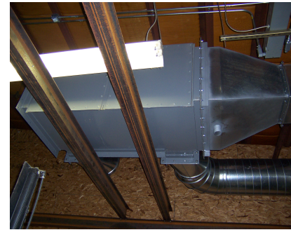
Delaware Valley's Second Heat Exchanger