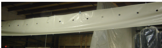
Plastic Bags are an Inexpensive Alternative to Metal Ductwork

Successful heat recovery projects such as this are likely to be broadly applicable to companies with operations producing waste heat.