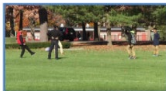
Children playing a pick-up soccer game on an organically-managed field in Springfield.

This case study provides detailed information on the number of hours played at three parks in Springfield: two large complexes and one single, full-sized soccer field. Communities wishing to estimate the number of playable hours on a soccer field can use Treetop Park, the full-sized soccer field, as the most relatable model of the three parks discussed here. Treetop Park is used for approximately 1,050 hours of practice, play, and informal activity